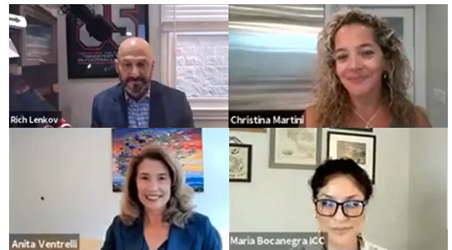
Legal Face-Off's Legal Grab Bag