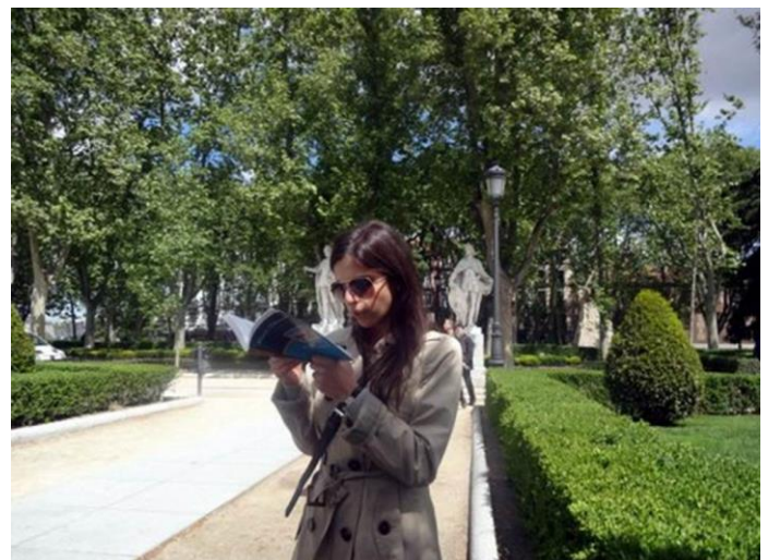
Reading about Madrid.

When I'm not working, I'm planning my next trip. I love to travel and try to take one big trip a year. I recently returned from Spain. I spent time in Palma de Mallorca, Toledo, Madrid and Barcelona. Each city had rich history, unique architecture, delicious food and lots to explore. Here are a few pics: