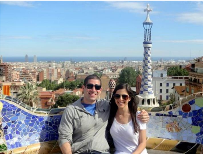
Enjoying the view of Barcelona with my husband in Guell Park.

Now that I'm back, I'm starting to plan next year's adventure: a four-day hike of the Inca Trail in Machu Picchu, Peru, to roughly 14,000 feet. I love to hike and am an avid runner, but this will definitely be a challenge. Hopefully, I'll live to tell you about the experience. Wish me luck!