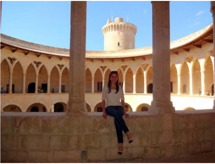
Inside Bellver Castle in Palma de Mallorca.